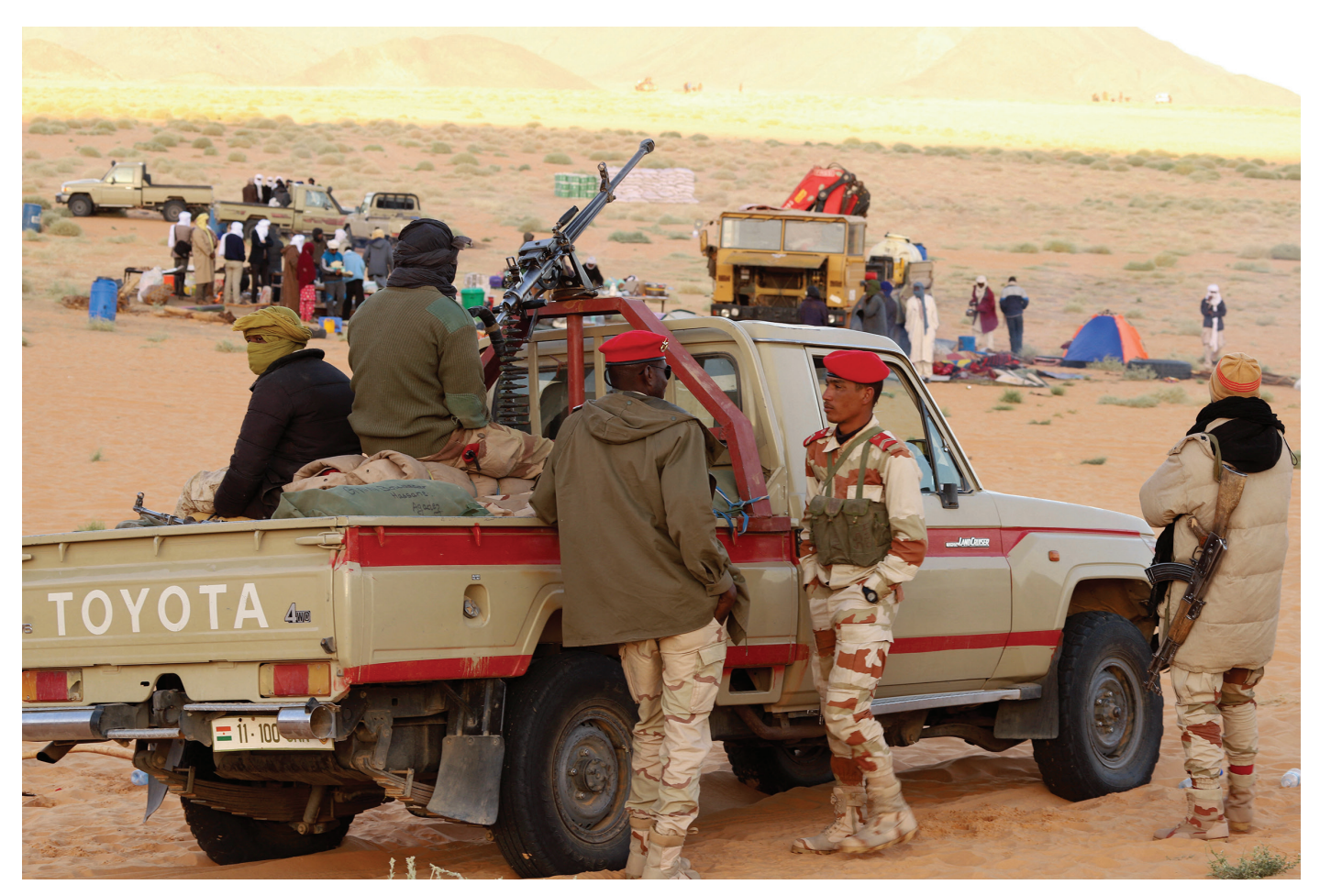
Niger's armed forces patrol in the northern region of Agadez.

help reduce instances of security forces abusing civilians, which are not only counterproductive but also a boon for insurgents' recruitment. Upholding human rights also strengthens government legitimacy. Specified troops might be designated "human rights referents" for an operation, which would make them responsible for ensuring that the provisions of armed conflict and international humanitarian law are observed.<sup>6</sup>